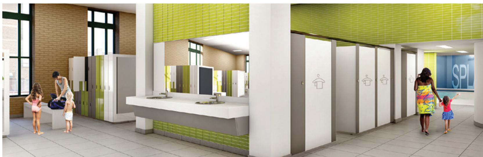
[Above] Photo of Michael Chartrand and rendering of universal changerooms