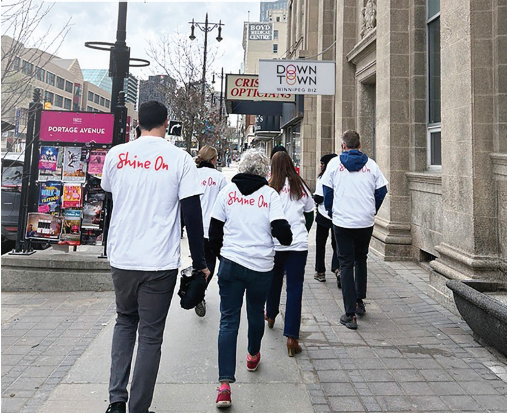
[Above] Downtown Y staff participating in a community cleanup