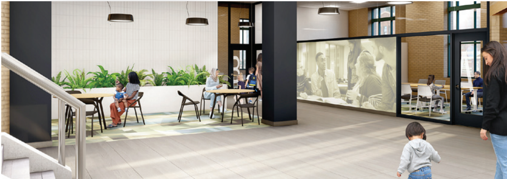
[Above] Photo of Tyler O'Brien and rendering of classroom and community spaces